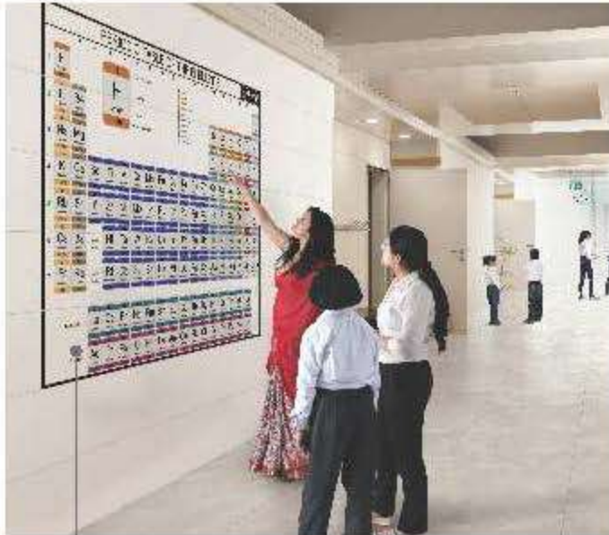
Tile Mural-Periodic Table