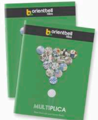
300x600, 300x450 & 250x375 mm Multiplica Wall Tiles Collection