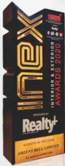
Website of the Year for www.orientbell.com (India's construction & design industry)

Realty+ recognizes the best of the best within the ranks of Indian Real Estate