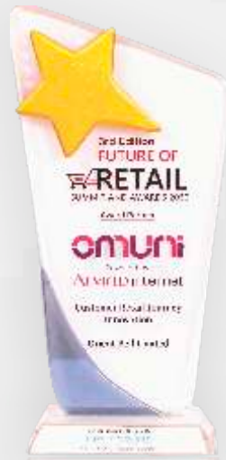
Customer Retail Journey Innovation Winners Future of Retail Summit & Awards 2020