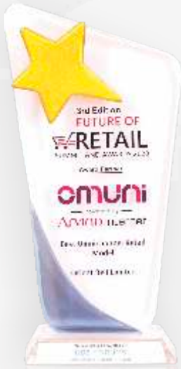
Best Omnichannel Retail Model Winners Future of Retail Summit & Awards 2020