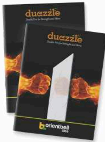
250x375 mm Duazzle Wall Tiles Collection