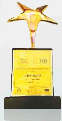
CEO with HR Orientation ZEE BUSINESS National Human Capital Leadership Congress & Awards

CORPORATE OFFICE: Iris House, 16 Business Centre, Nangal Raya, New Delhi – 110046, India Tel: +91-11-47119100 CIN: L14101UP1977PLC021546