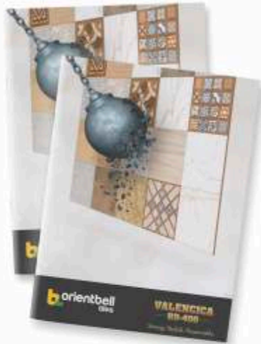
600x600 mm Valencica Floor Tiles Collection