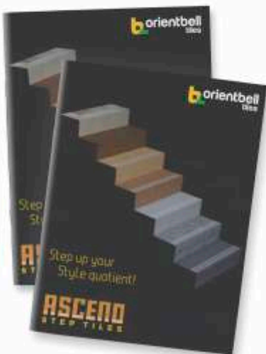
300x300 mm ASCEND Step Tiles Collection