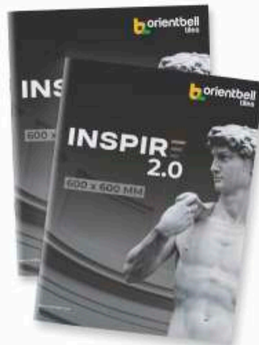
600x600 mm INSPIRE 2.0 Floor Tiles Collection