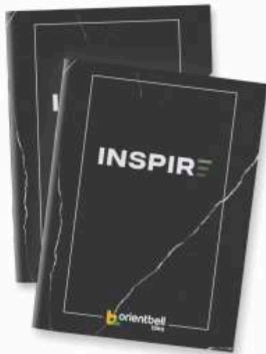
600x1200 mm INSPIRE Floor Tiles Collection