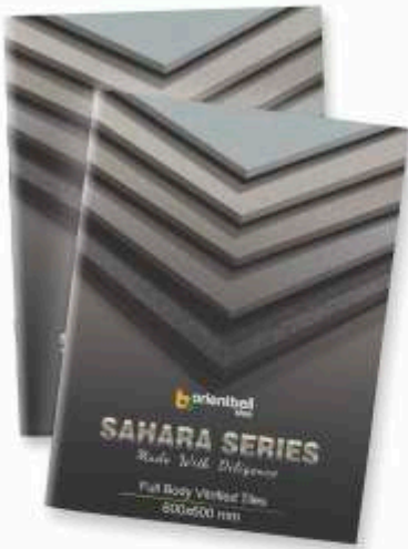
600x600 mm Full Body Vitrified Tiles Collection