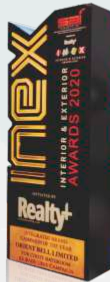
Integrated Brand Campaign of the Year for "Chote Bathroom ke Bade Upay" (India's construction & design industry)