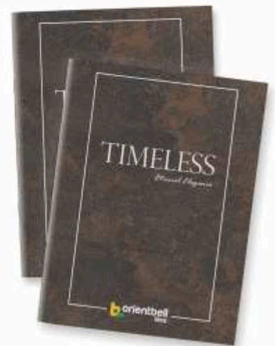
400x400 mm Timeless Pavers Tiles Collection